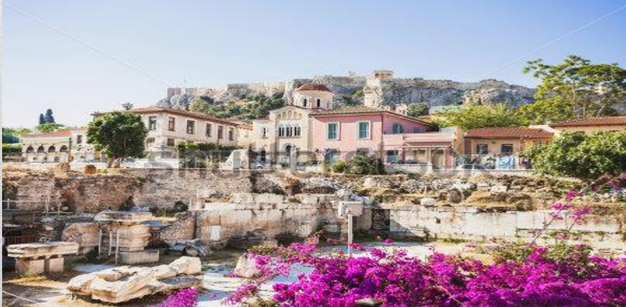
Plaka District (Old Athens)