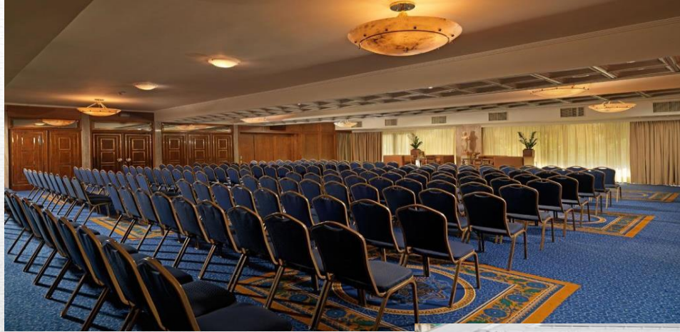
Spacious Lecture Halls

New Acropolis Museum (5 min walking distance)