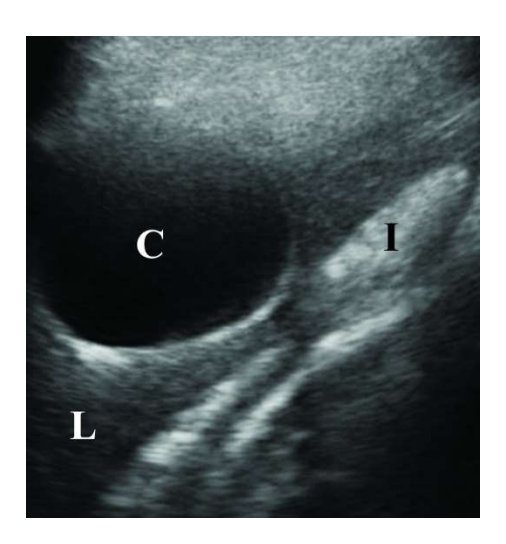
Figure 1 – Abdominal ultrasound (L - liver; C – cyst; I – intestine)

Ultrasonographic examination of the abdomen revealed a mildly increased wall thickness of the large colon on the right side of the abdomen and an approximately 47 mm in diameter, hypoechoic, cystic structure in the liver (Figure 1). Doppler mode showed this structure not to be vascularised.